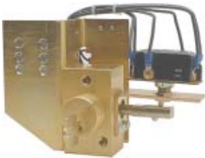
SKRU - Unhoused