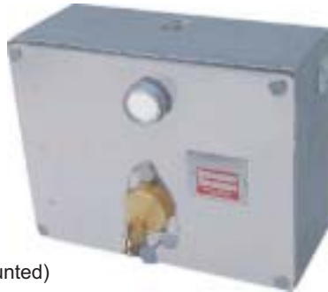
SKRU - Housed (Front Panel Mounted)