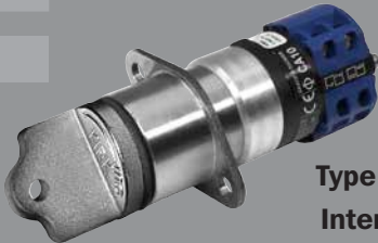
Type PPS Interlock