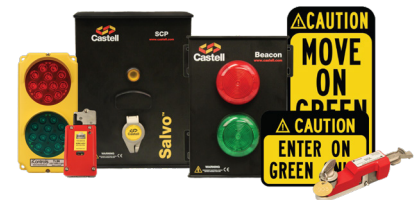
Salvo SAMD Loading Dock Safety Kit

Salvo Loading Dock Safety Systems reduce the risk of accidents at the loading dock by preventing drive-aways during loading/unloading by interlocking the trailer's air brakes with the dock door. This ensures that the trailer cannot depart until loading/unloading is completed and the dock door is closed. Salvo Loading Dock Safety Systems keep your personnel and equipment safe by – eliminating human error.