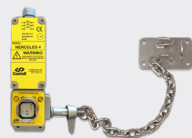
Salvo Manual Door Lock (SMDL)